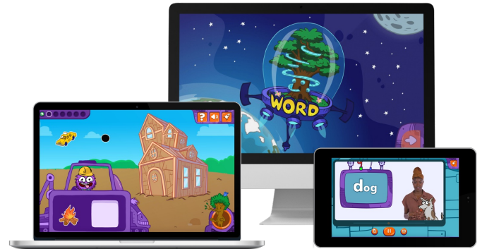
WORD Force: A Literacy Adventure

We're proud to announce a refreshed digital course with newly added direct instruction videos, game onboarding, level-specific interventions for students who need more guidance in the course, an eBook library equipped with a read-to-me feature, and adaptive pathing to personalize the learning experience for all students.