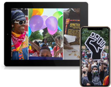
306: Continuing the Story is Mobile-Friendly

Standards Alignment: C3 Social Studies Standards, Common Core State Standards in English Language Arts and College and Career Readiness